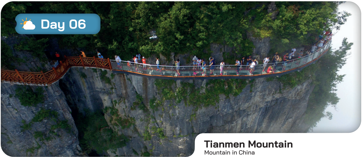
Tianmen Mountain Mountain in China