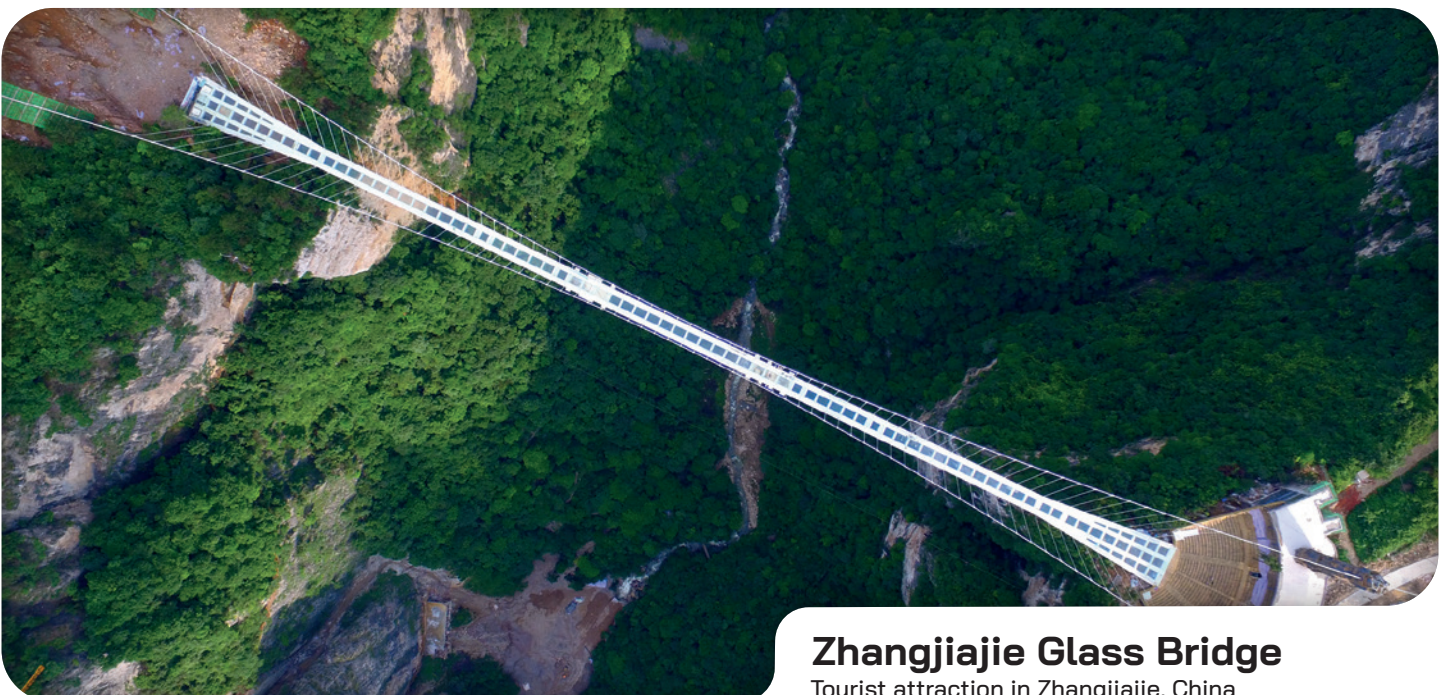
Zhangjiajie Glass Bridge Tourist attraction in Zhangjiajie, China