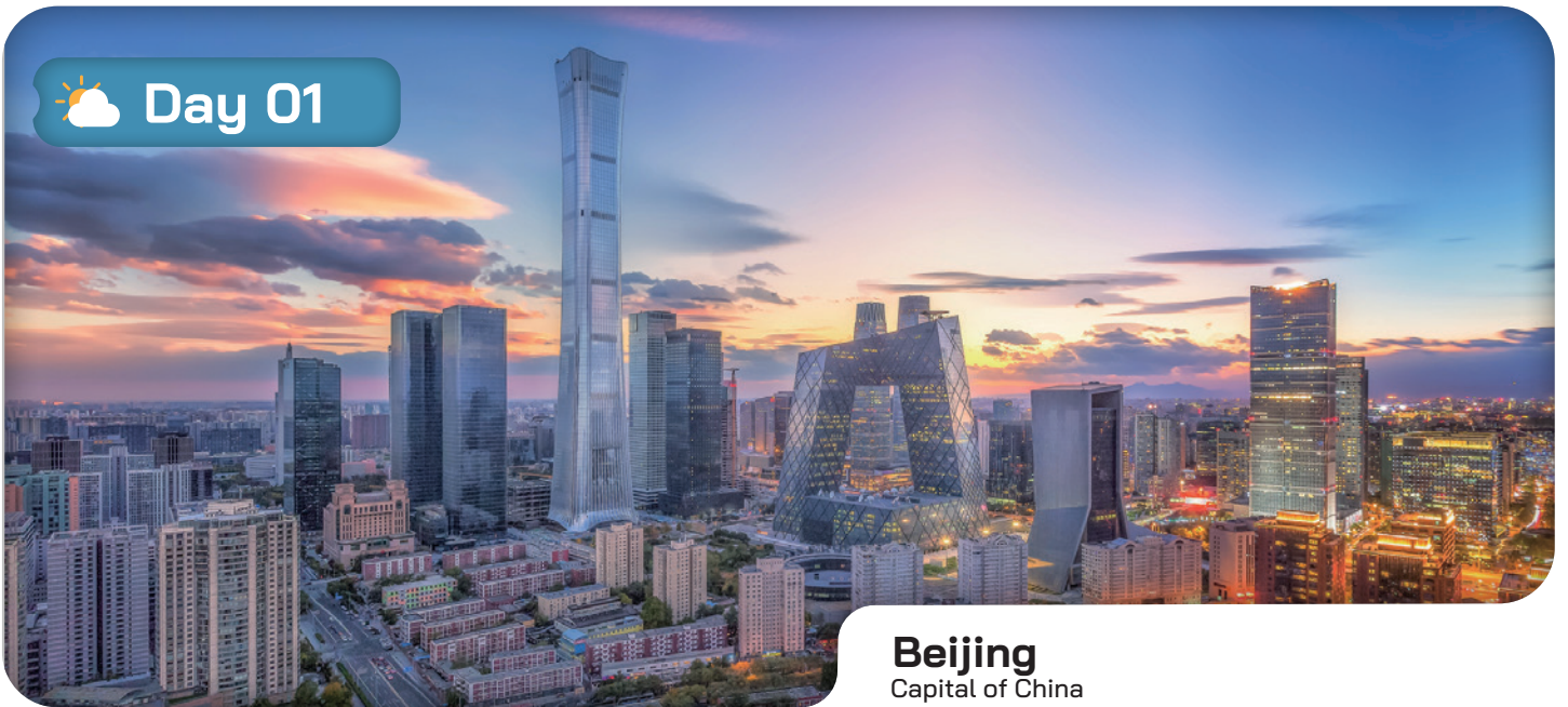
Beijing Capital of China