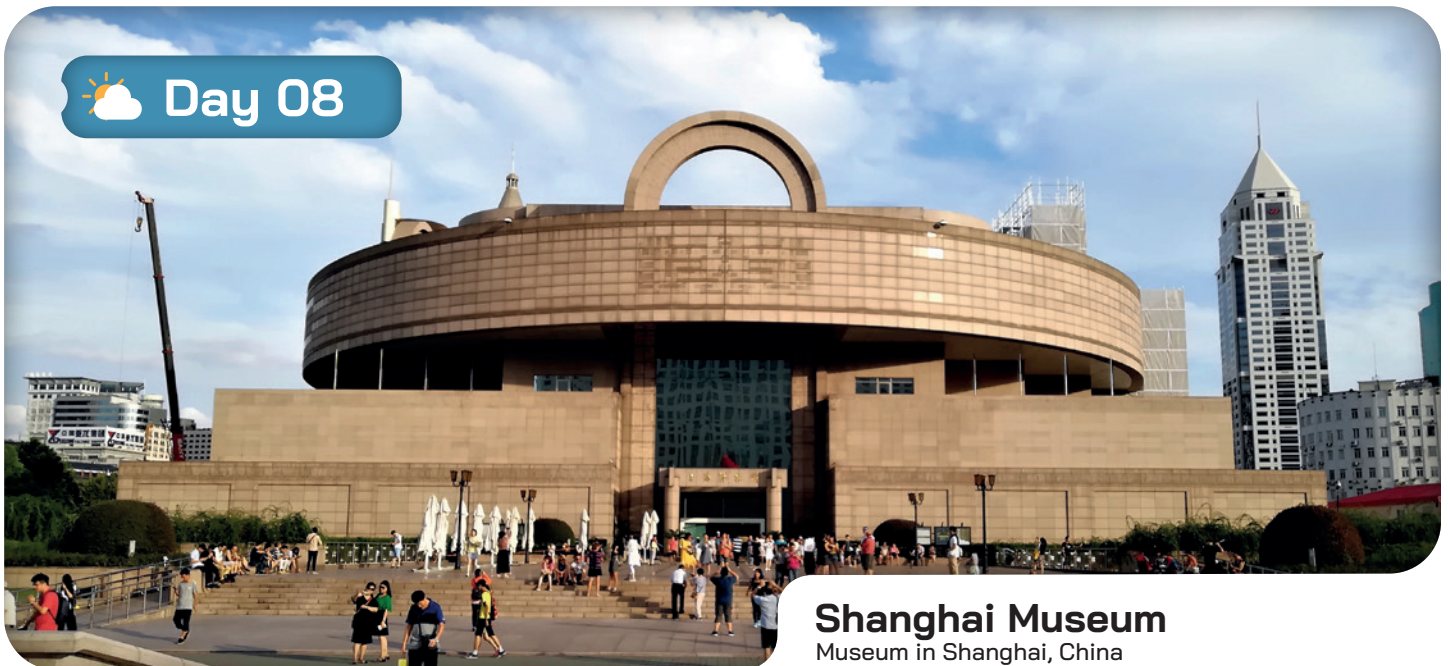
Shanghai Museum Museum in Shanghai, China