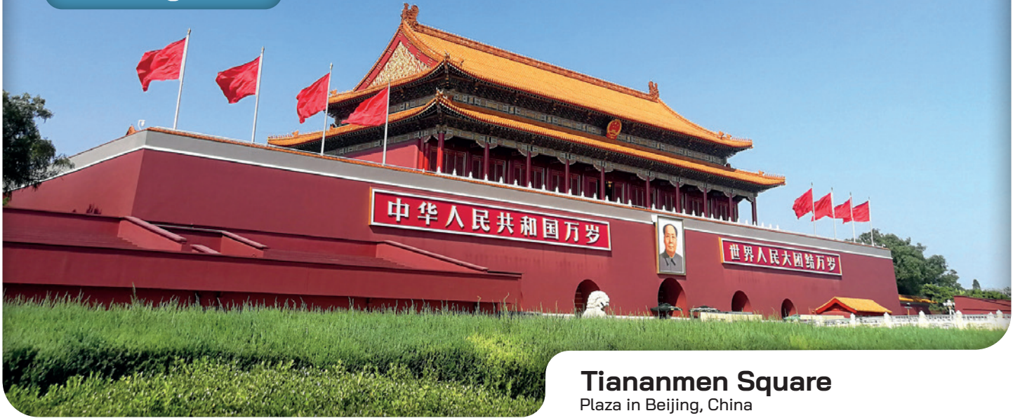
Tiananmen Square Plaza in Beijing, China