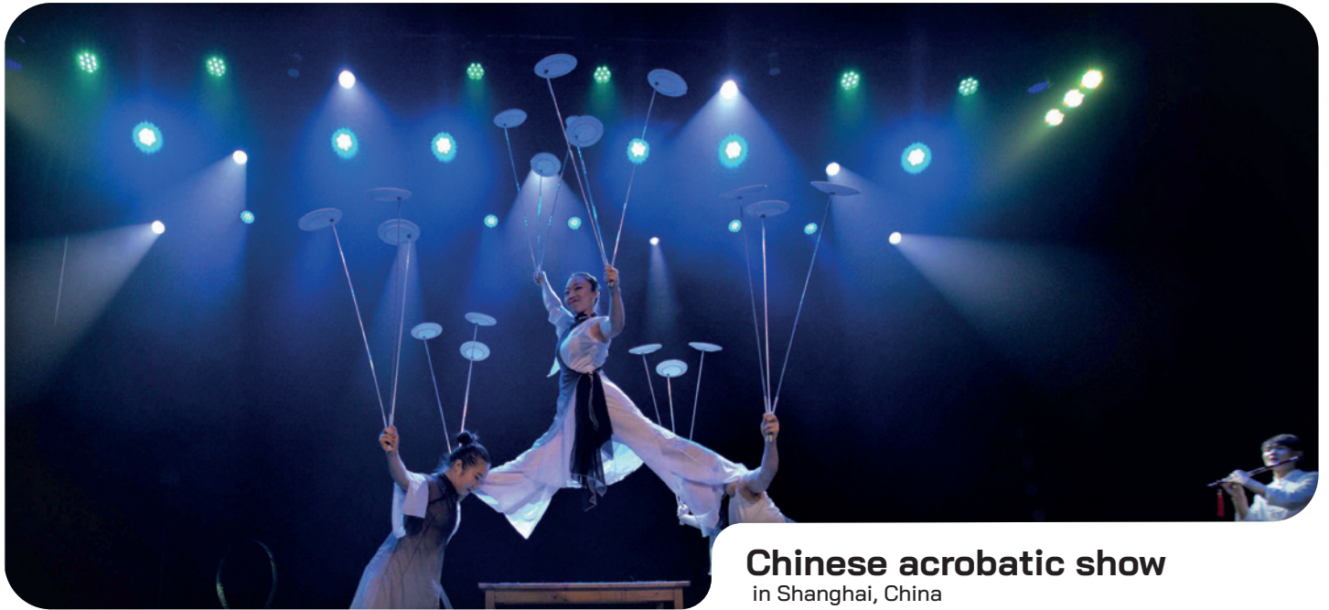
Chinese acrobatic show in Shanghai, China

Distances on all Shanghai highways originate from People's Square and significant city institutions such as the Shanghai People's Government, the Shanghai Grand Theatre, the Shanghai Museum, and Nanjing Road Pedestrian Street are all situated around the square. It is an important meeting place and public space. Walking through the square provides a great view of many of Shanghai's most recognizable skyscrapers.